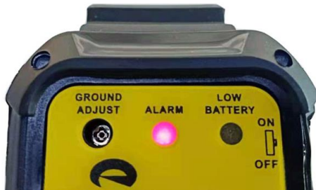
Light and sound warn the worker when a ground defect occurs less