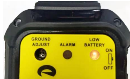
A low battery LED illuminates when the battery charge drops to 20% or

A-E1 ESD Wrist Strap is designed to be an onsite guide for controlling work and reducing defects when used in general work environments and by device operators. A unique blinking LED indicator as well as a high octave audible alarm sound alerts the operator of a cord break, loose pin jacks, or other ground defects. Additionally, the built-in LED and audible alarm will notify the technician of low battery life when it reaches below 20%. These special built-in alarms help managers and supervisors to achieve “zero” defects on the assembly floor.